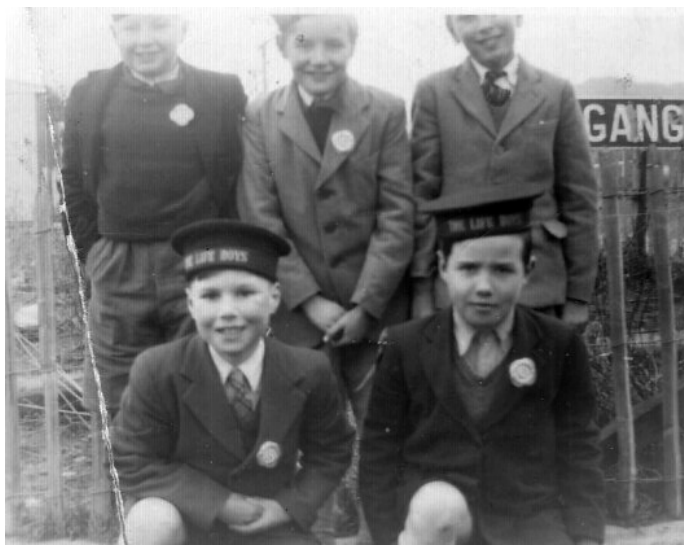
Oxfangs Life Boys at Oxfangs Grove in 1953.