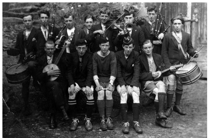
Leith Boys Brigade Band in 1920.

A photo of the 43rd St Nicholas Sighthill Boys Brigade and Life Boys at Lesmahagow camp in 1962.