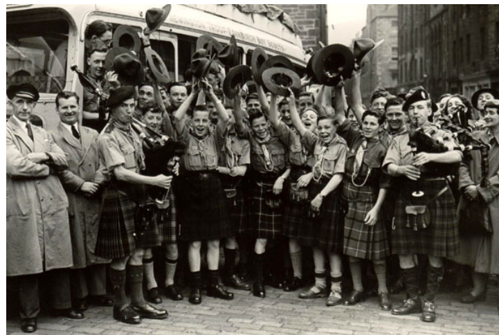
Newington troop Boy Scouts setting off for camp in 1950.