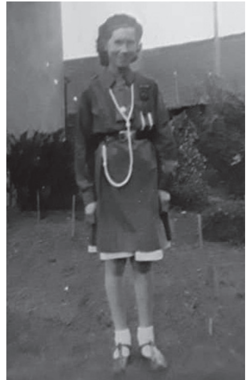
A Brownie from St Nicholas Church in 1963.