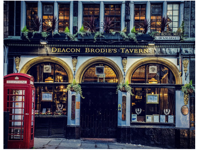
Deacon Brodie's bar is on the corner of the Lawnmarket and the Mound.