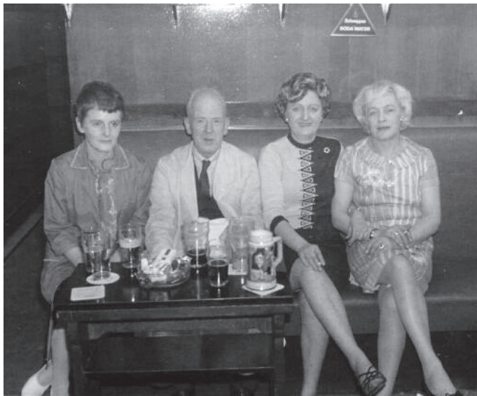
Staff having a drink in the Lochrin Arms in Tollcross, 1970.