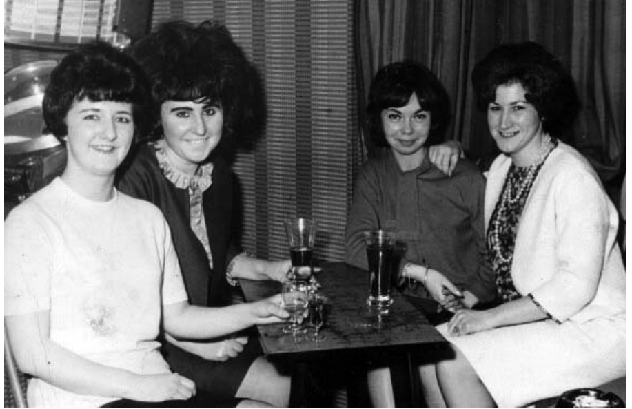
Friends having a drink on a Friday night before going to the Palais de Danse in Fountainbridge in 1960.