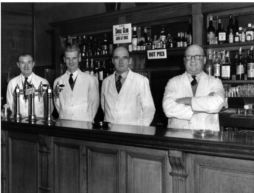
The Horseshoe Bar in Cockburn Street, 1950.