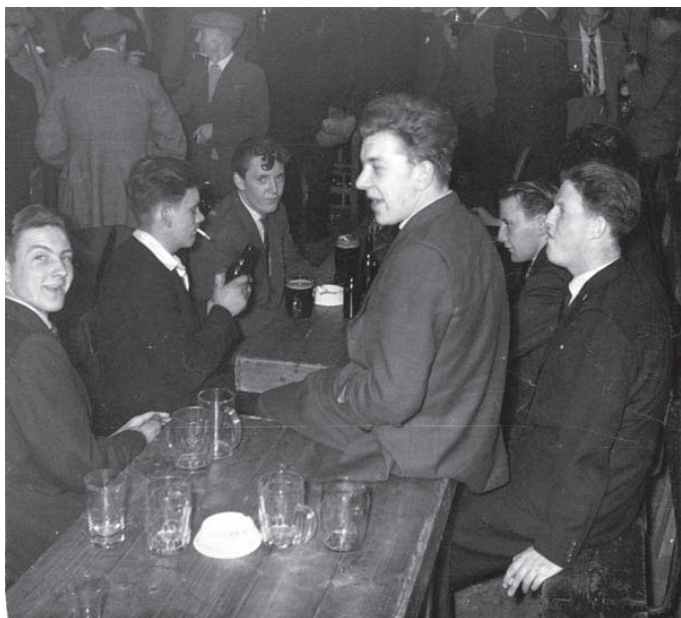
Henry Robb Shipyard Electricians' Social Club in 1952.