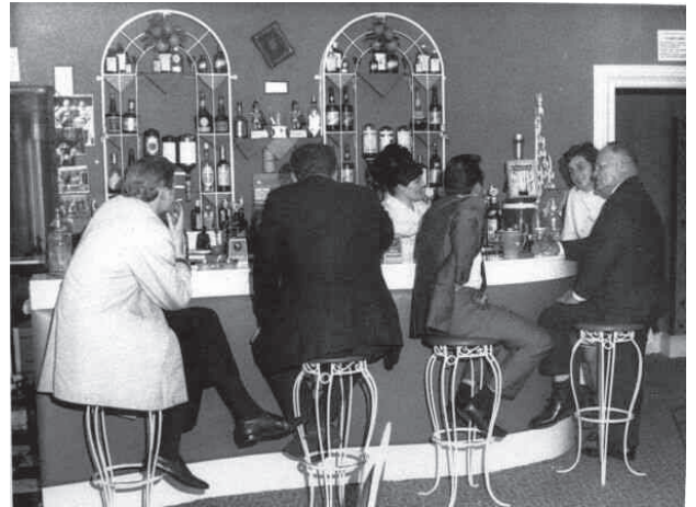
Do you recognise this hotel bar from 1967? It's either a hotel bar in Portobello or the old 'Links' in Bruntsfield.