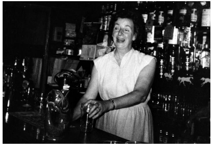
A cheery barmaid working at the White Horse pub in the Royal Mile in 1977.