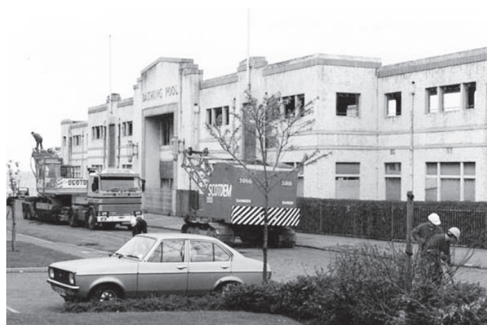
The pool closed in 1979, not long after the power station, and was demolished in 1988. The area is now used for five-a-side football.