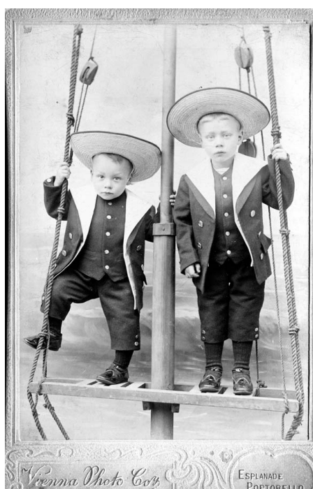
Studio portrait of two young boys standing on a mast, 1908. It was taken at the Vienna Photo Company Studio on the esplanade, Portobello.

In the 1960s, Portobello Beach was a bustling seaside resort with a large promenade, amusement arcades, and funfair attractions, drawing thousands of holiday-makers, especially from Glasgow.