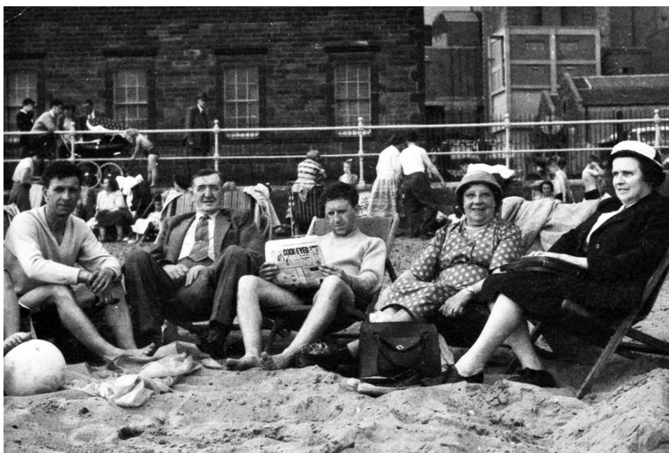
People relaxing on deckchairs at Portobello beach in July 1959.

Portobello's outdoor swimming pool was opened in 1936. It was equipped with diving boards and a wave machine, and was open between May and September.