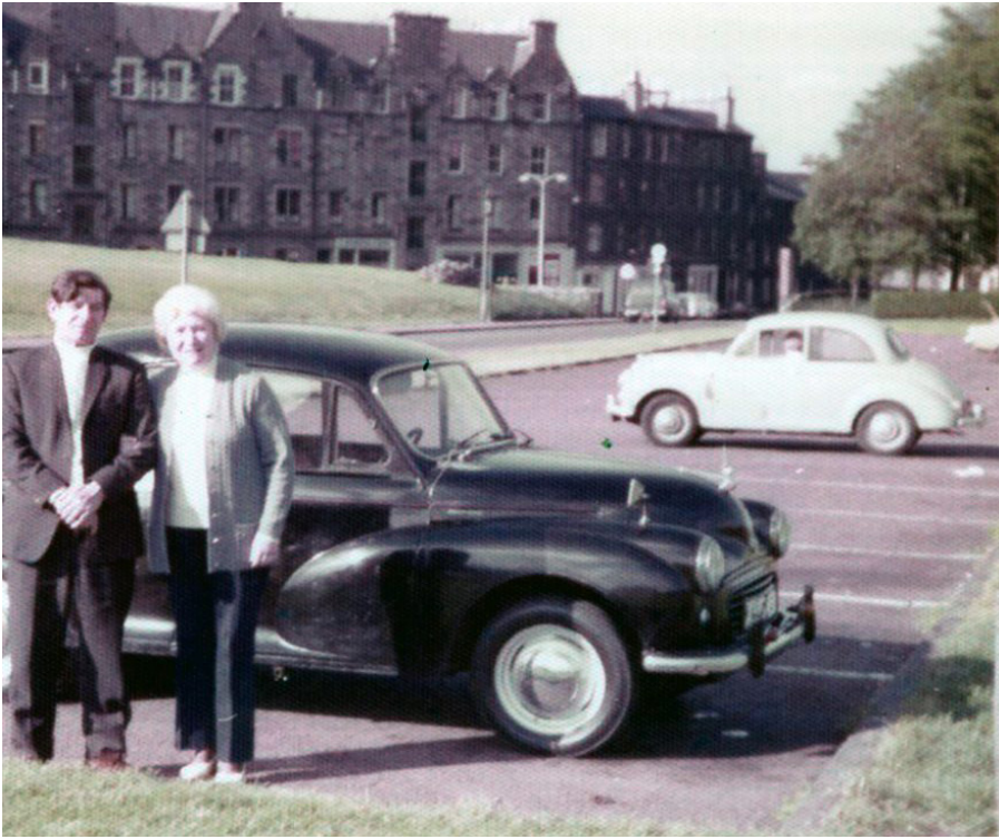
A couple standing by their car on a day trip out to Holyrood Park in 1975. Their car is a black Morris Minor. The car in the background is also a Morris Minor.