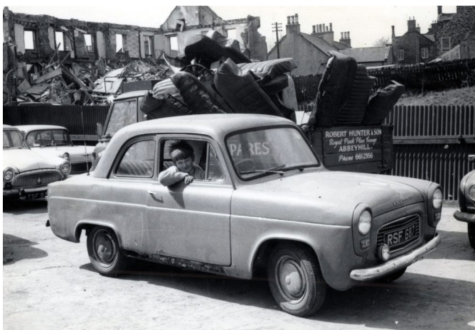
Ford produced small family cars such as the Ford Prefect, Ford Popular and Ford Anglia.