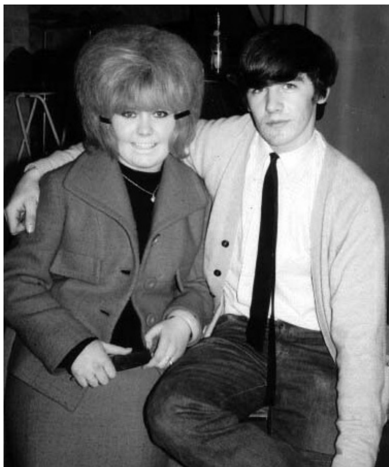
This photo was taken in 1965 at the Hive Club. They are both in the fashion of the times. The woman's hairstyle is like Dusty Springfield's.