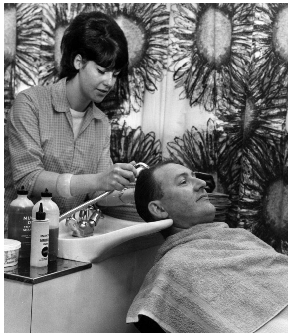
A customer receiving a hair wash before his haircut.