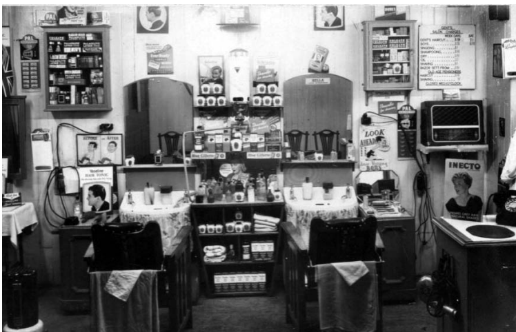
This photo shows the original shop in the West Port surrounded by hair products for sale. Photo courtesy of Edinburgh Collected.

There is a wireless for customers to listen to. On the shelves are various products for sale, such as, Blue Double Edge Gillette Blades, hair tonics and creams. Photo courtesy of Edinburgh Collected.