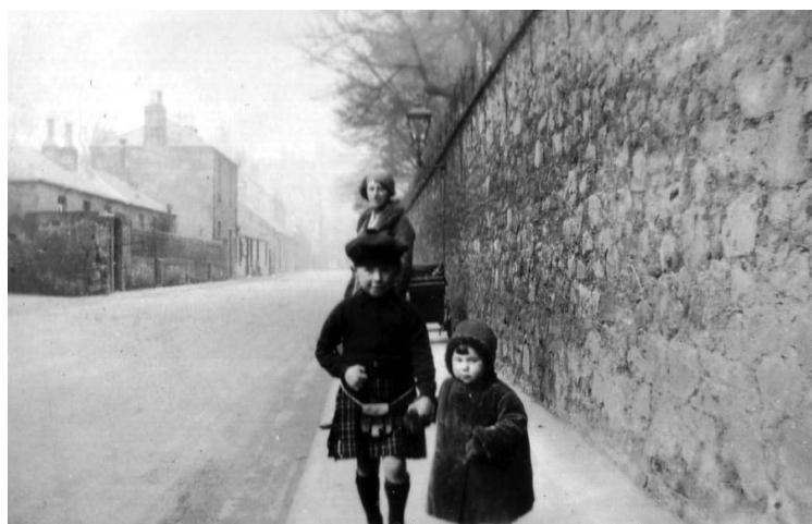
Out for a walk in Canaan Lane 1931.

The so-called ‘Morningside accent’ is often portrayed, and caricatured, in popular culture as an over-refined and affected ‘pan loaf’ accent, similar to a perceived upper-class English accent. The accent was famously used by Maggie Smith in her portrayal of the title character in the 1969 film version of The Prime of Miss Jean Brodie .