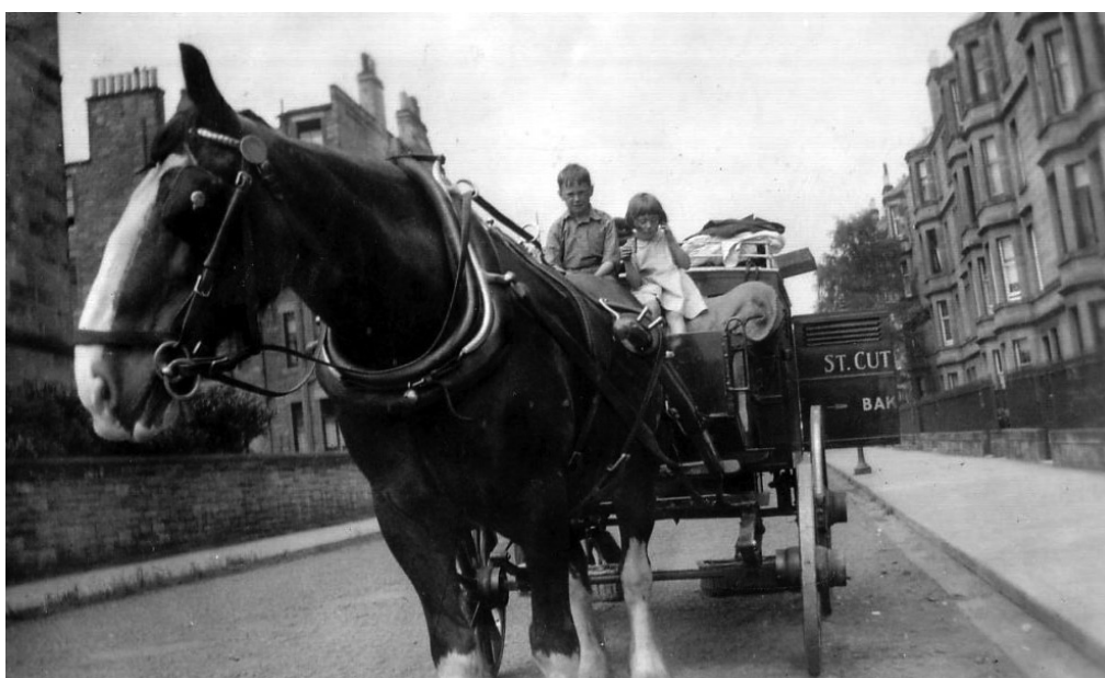
St Cuthbert’s Bakery delivery horse in Falcon Gardens with children sitting in the driver’s seat in 1934. This photograph is taken looking north along Falcon Gardens in Morningside.

The so-called ‘Morningside accent’ is often portrayed, and caricatured, in popular culture as an over-refined and affected ‘pan loaf’ accent, similar to a perceived upper-class English accent. The accent was famously used by Maggie Smith in her portrayal of the title character in the 1969 film version of The Prime of Miss Jean Brodie .