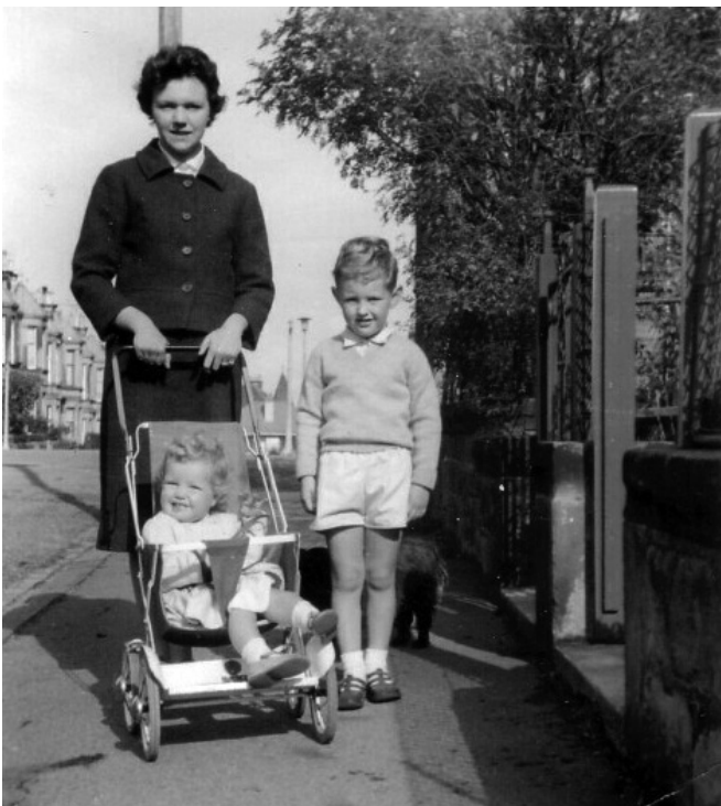
A mother out for a walk with her two children on Morningside Drive in 1962.

Morningside is a thriving residential district. Its main shopping street, Morningside Road, is noted for its variety of shops and cafés, many of which are independent businesses.