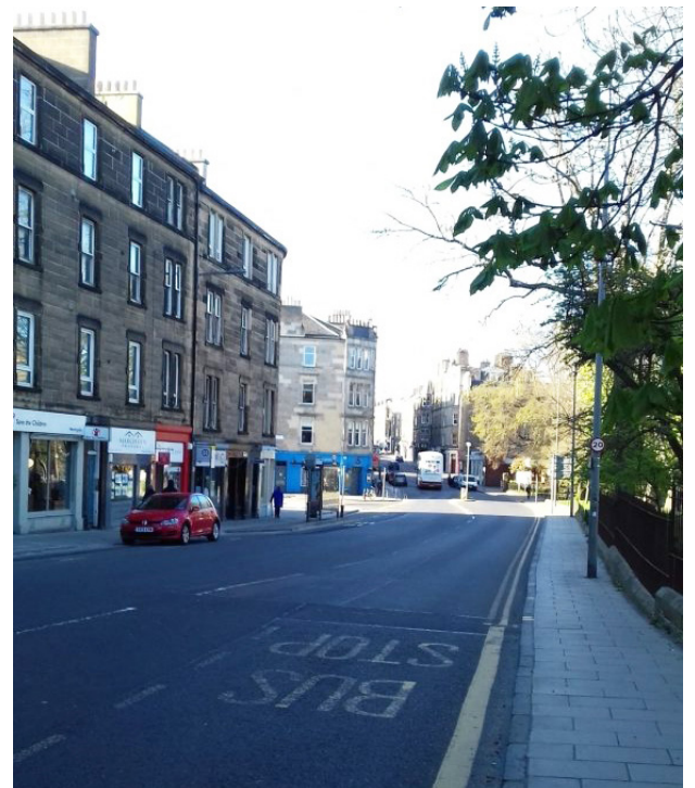
An empty Morningside Road during lockdown in 2020.