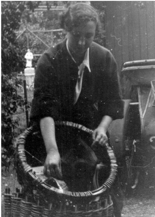
A fishwife in Morningside. The creel was where they kept the heads and skins from the fish. The skull was used for carrying the fish, then they laid a board on it for filleting. A broad belt supports the creel, crossing over the forehead for carrying it.