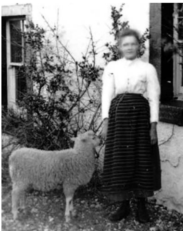
A girl with a pet lamb at Bell's Mill in the 1900s.