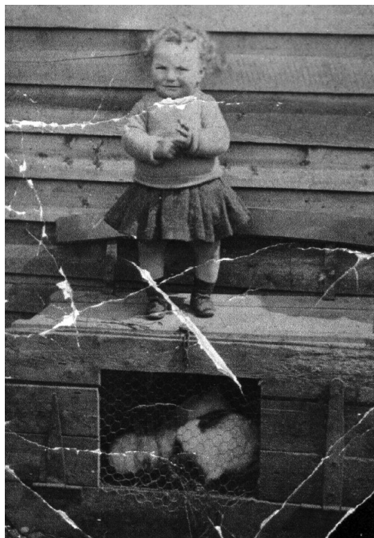
A young girl standing on top of her rabbit hutch in 1945.