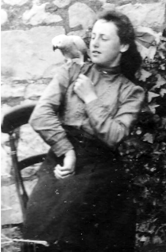
A girl with a parrot on her shoulder. This photo was taken in her garden in 1914.