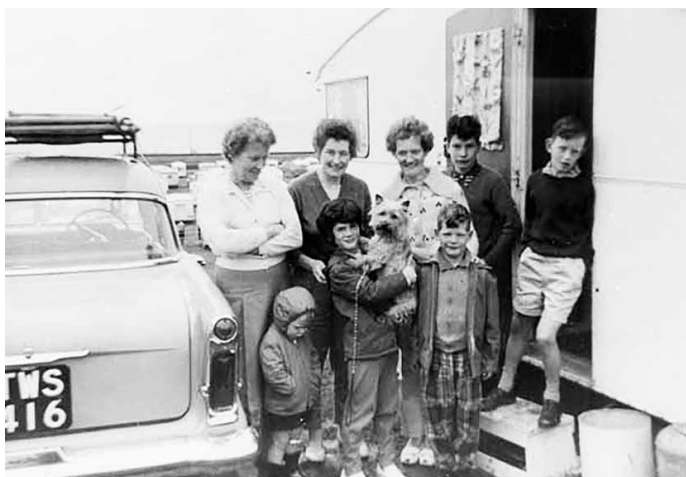
A family on a caravanning holiday in 1965 with their dog.