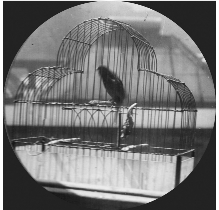
A pet bird in a cage, 1910.