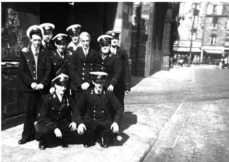
This is a group of newly qualified bus inspectors outside the tram depot in Tollcross Edinburgh. This is now the site of Tollcross Fire Station.

The Forth Road Bridge was constructed by a consortium of three engineering firms; Sir William Arrol & Co, the Cleveland Bridge & Engineering Co, and Dorman Long Ltd, and took the name, The ACD Bridge Company. The bridge was constructed from 1960-64. This picture is from 1962.