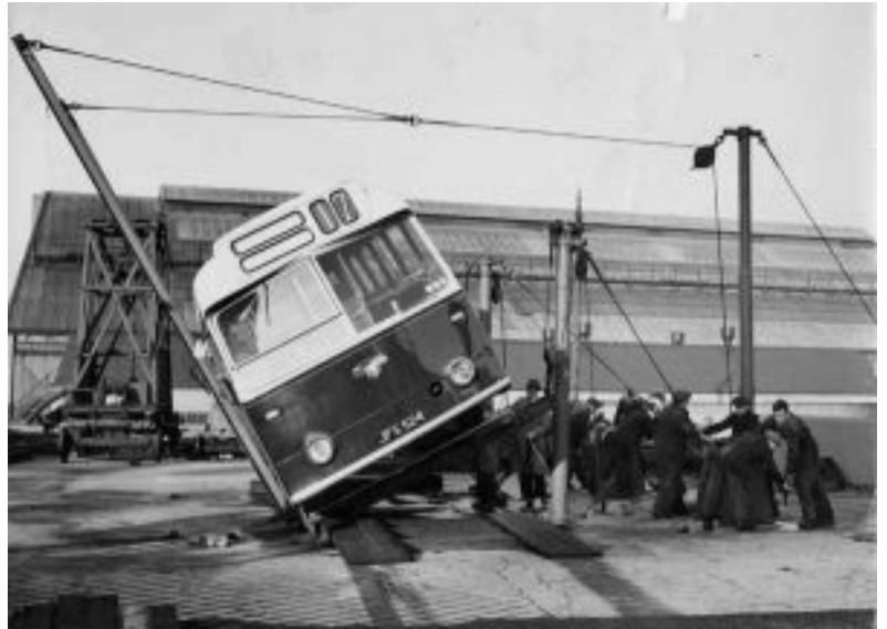
Mechanics working on a coach at Shrubhill Bus & Tram depot in 1960.