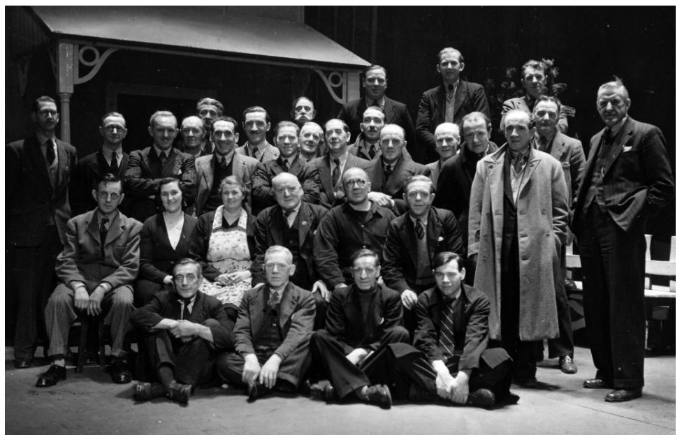
This photo was taken on the set of Oklahoma at the King's Theatre. It shows the theatre crew on stage in 1960.