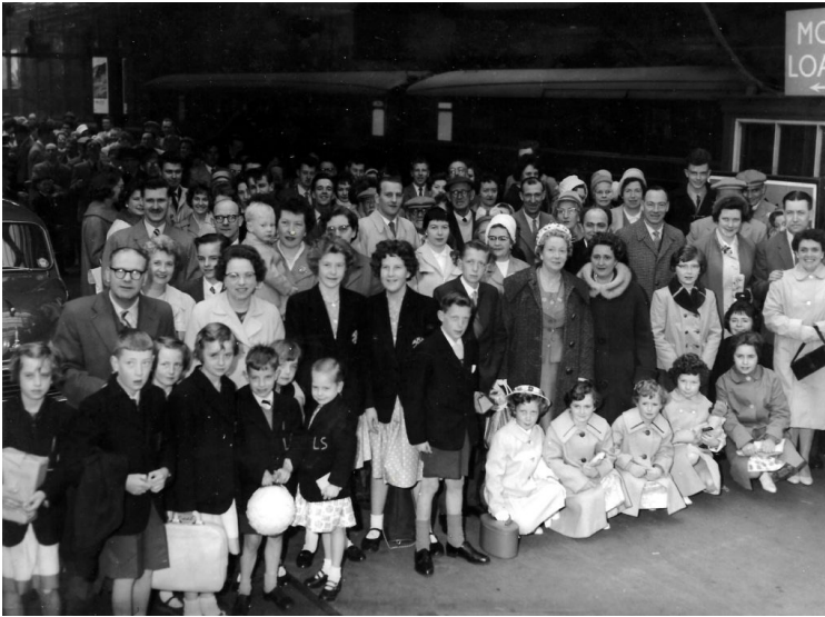
This photo shows a workers and families outing to Glasgow in 1960. Bertrams was an engineering company that manufactured machinery for the papermaking industry. It had a plant, St Katherine's Works, in Sciennes.