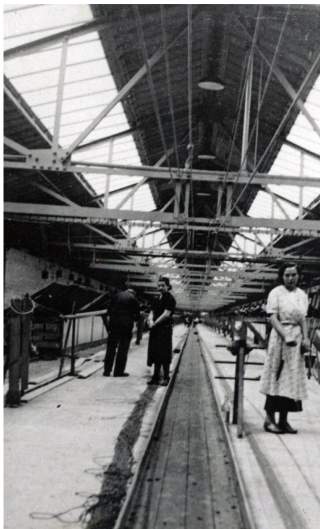
Workers in the grand hall of the rope works in Leith in 1955.