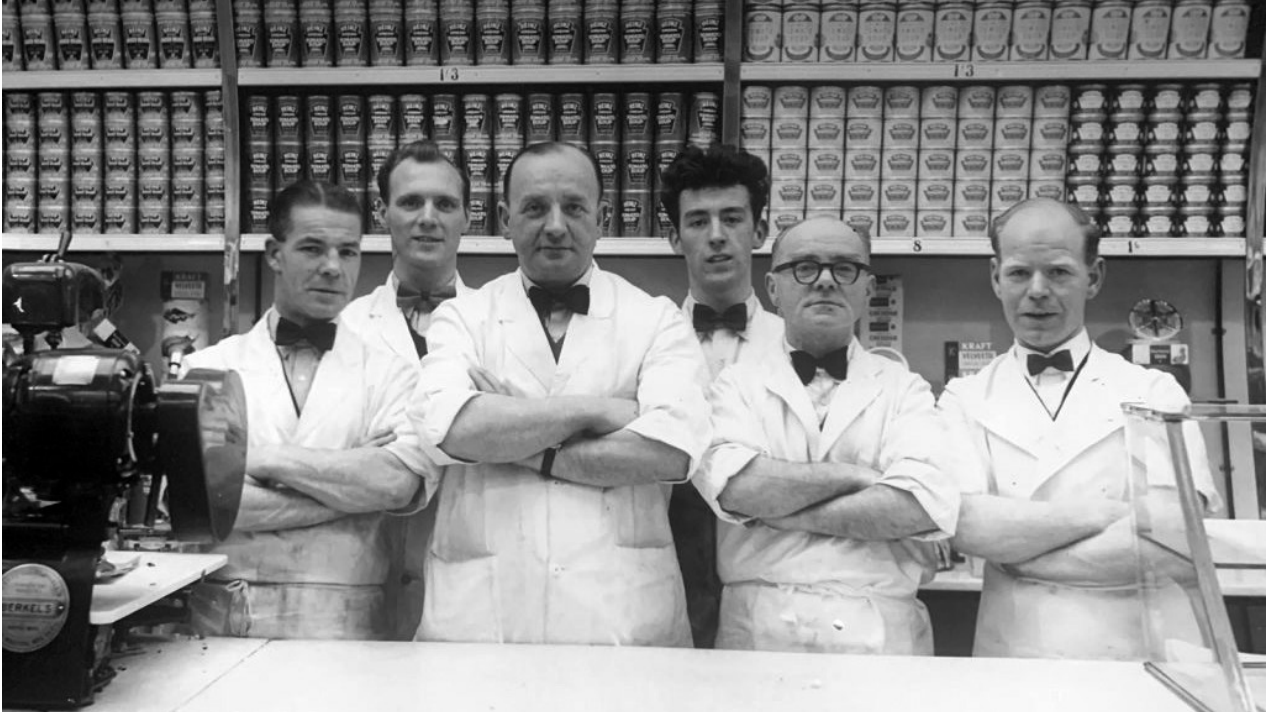
Leith Provident Co-operative Store on Great Junction Street, 1955.

The first St Cuthbert's store was opened in 1859 at the corner of Ponton Street and Fountainbridge. Can you still remember your Store number?