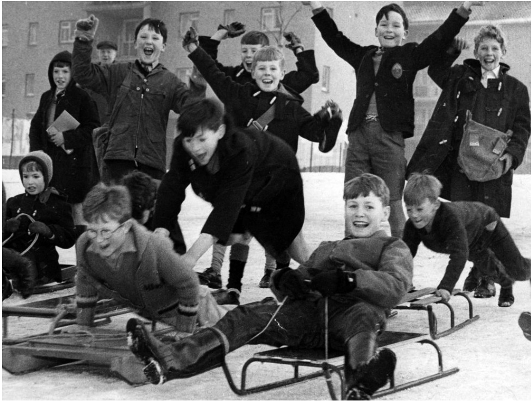
Sledging in Oxgangs in 1960.