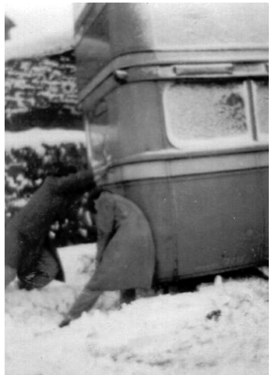
Giving the bus a push up the hill in the snow in 1935!