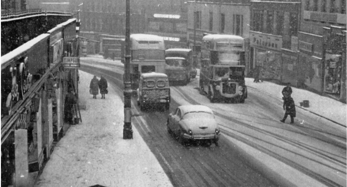
Traffic in the snow at the top of Leith Street in 1965.