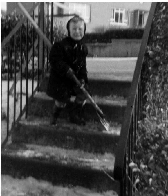
Clearing the snow from the steps in 1965.