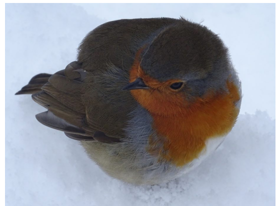
A wee Robin redbreast in 2010.