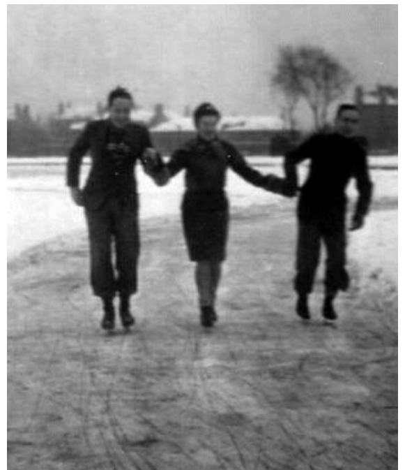
Skating in the park in 1936.