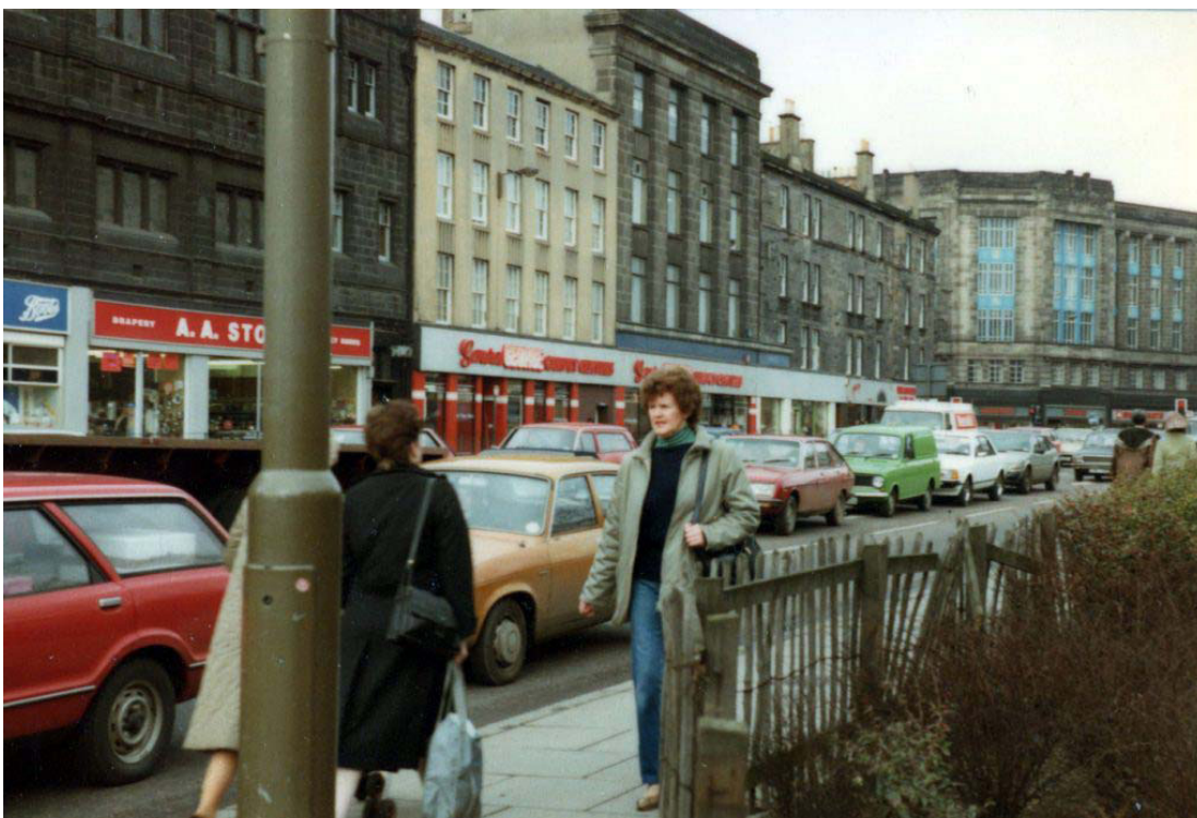
Looking north along Earl Grey Street from Tollcross, c.1982.