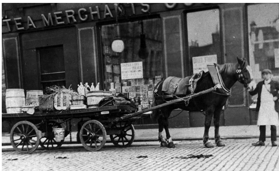
Delivery horse and cart outside Cooper & Co, 71 Lothian Road, on the corner with Grindlay Street. It's now a Nando's. This photo was taken in 1905.

Lothian Road can be traced back to 1784 when the Town Council wanted to build a road connecting the west end of Princes Street with Bruntsfield Links.