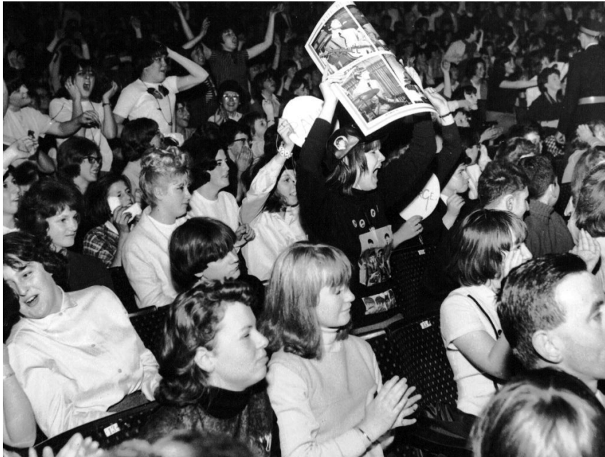
The crowd go wild for the Beatles at the ABC Cinema on Lothian Road in April 1964. The Beatles played three sold out shows at the ABC Cinema as part of their 1964 British tour. Beatlemania swept through Edinburgh!