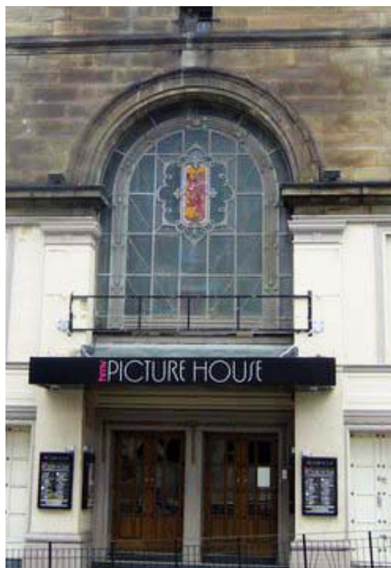
The Caley Picture House closed its doors in 1984. It opened as a disco in 1986. It is now part of the Witherspoons chain of pubs.