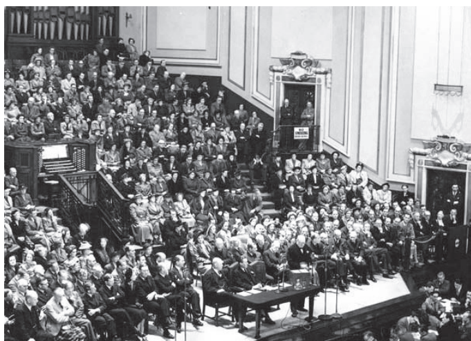
Winston Churchill speaking at the Usher Hall in 1955.