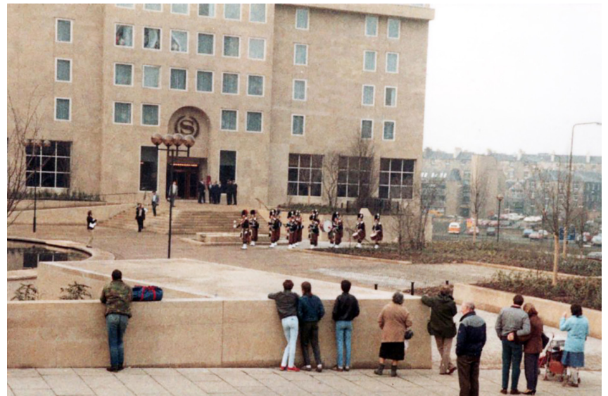
Pipe Band performing in front of the Sheraton Hotel on Lothian Road. The Sheraton opened its doors in 1985.