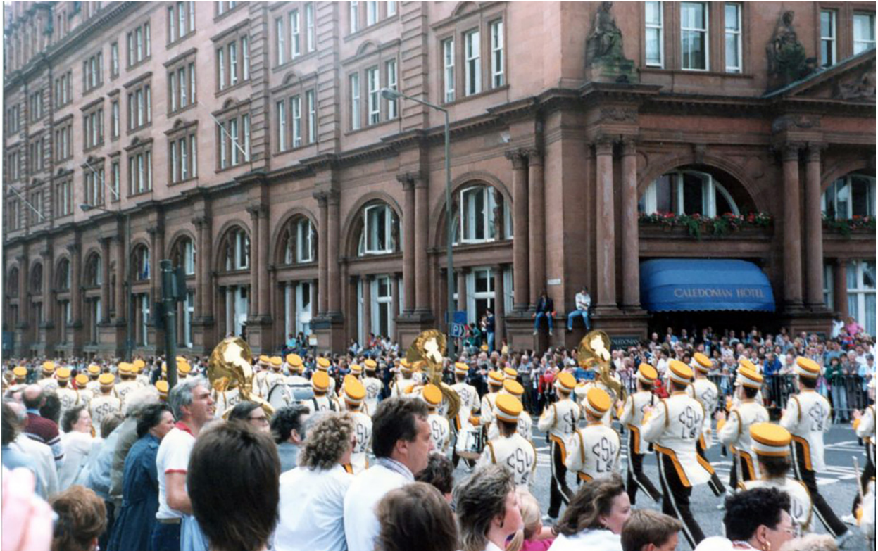
Jazz Band playing as they walk up Lothian Road as part of the Jazz Festival Parade in 1987.