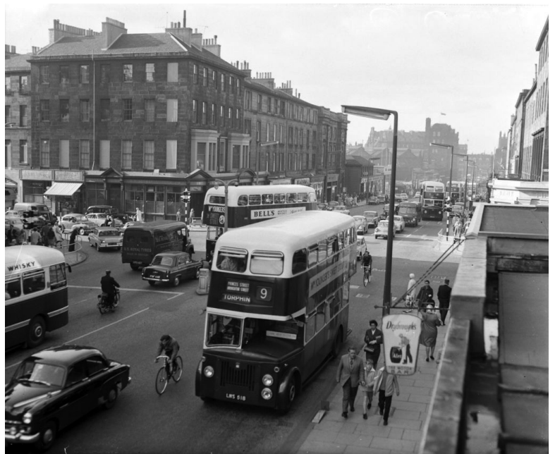
Lothian Road looking down towards Princes Street in 1965.