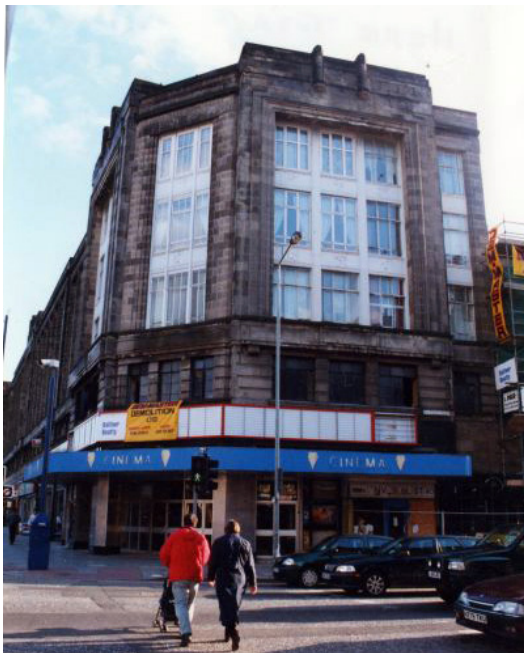
ABC Cinema during the demolition of the auditorium, 2001.