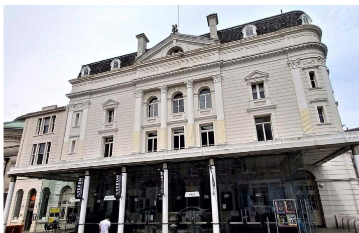
The Royal Lyceum Theatre is a 658 seat theatre in Grindlay Street.