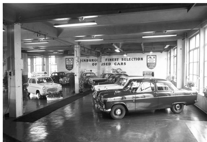
Alexander's Car Showroom was located on Lothian Road, across from Festival Square.