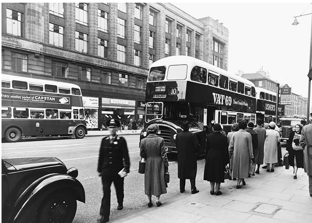
Corporation buses on Lothian Road in 1958.

Lothian Road can be traced back to 1784 when the Town Council wanted to build a road connecting the west end of Princes Street with Bruntsfield Links.