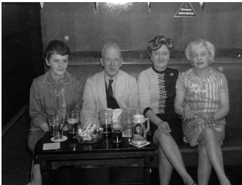
Bar staff having a drink in The Lochrin Arms, Tollcross.

Brewing started in Edinburgh with the monks of Holyrood Abbey as early as the 12th century. By the latter part of the 19th century Edinburgh could boast some 40 breweries, including big names, such as, Drybroughs, Campbells, Youngers and McEwans.