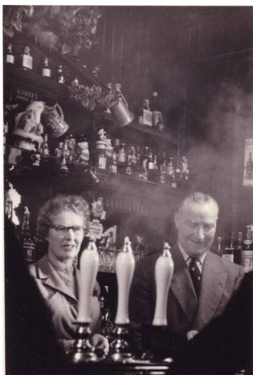
Kirknewton bar in 1956 with the landlord and landlady behind the bar.

The pub is regarded as a peculiarly British phenomenon. Its roots go back to the Middle Ages. The pub evolved out of the older inns and alehouses, which generally provided for the traveller, by way of the taverns of the 17th century which were places where locals could meet and socialise. The pub's name comes from the fact that purveyors of alcohol opened up rooms in their residence to the public.