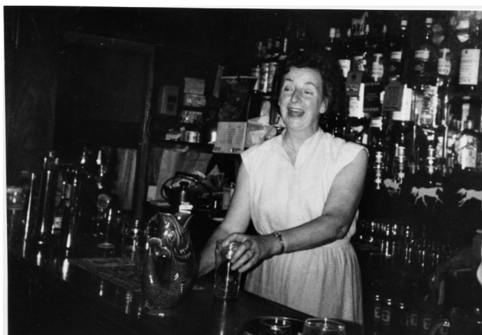
A cheery barmaid working behind the bar of the White Horse, in the Canongate, 1977.