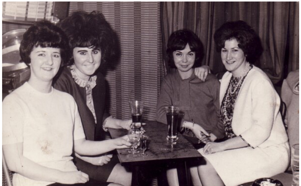
Friday night at The Haymarket Bar in 1960. The four women are having a drink on a Friday night before going to the Palais de Danse in Fountainbridge.