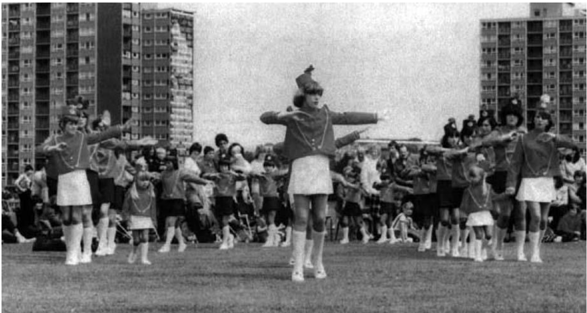
Colinton Mains Park. A group of majorettes, possibly the Bellettes.