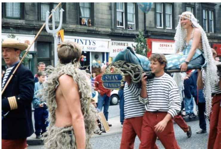
On the right, a mermaid in Leith Pageant in 1995.