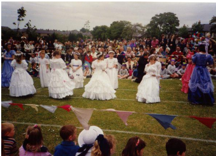
Newtongrange Gala Day Dress Competition in 1988.

We used to get a bag with a pie, a bun and a bottle of milk. There were races in the park after the parade and there were prizes handed out at the end. Says George Sloan