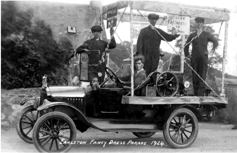
A fancy dress float in Earlston in 1924.