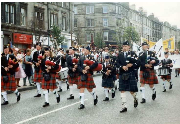
The Pipers marching in Leith Pageant in 1995.

We used to get a bag with a pie, a bun and a bottle of milk. There were races in the park after the parade and there were prizes handed out at the end. Says George Sloan