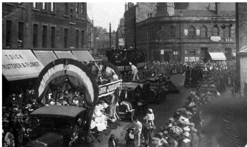
Leith Pageant at Great Junction Street, 1910. Thousands of people would line the streets to see the floats and to donate a couple of pennies to Leith Hospital.