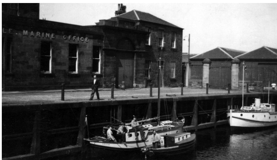
This photo shows boats moored at Customs House on Water of Leith, in 1966 when it was tidal. A lock has been put in since then.