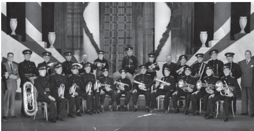
Leith silver band in the town hall in 1955. The band played regularly, often at the Foot of the Walk around the Victoria statue. They competed in many band competitions.

Towergate, the old entrance to the docks in Tower Place. There was a very popular transport cafe just near the Tower Place gate.