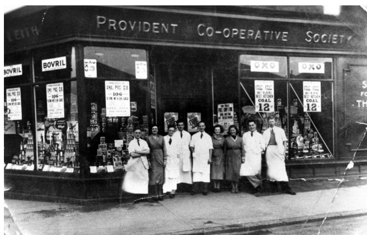
Staff outside the Lochend branch of Leith Provident Co-op in 1935. Each time a member made a purchase, they gave their membership number to the checkout operator, so that their purchase would count towards their dividend.