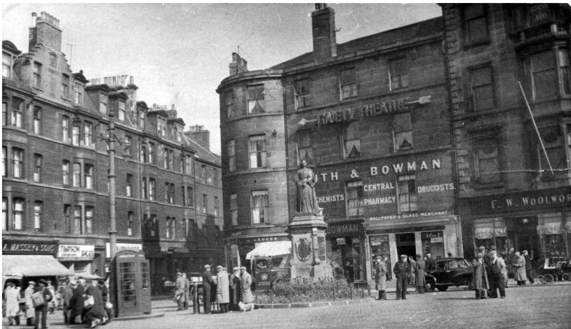
Foot of the Walk, 1951.

Leith Provident Co-operative Society was based on the principle of being owned and controlled by its members and being operated for their benefit. Rather than profits from the business going to one owner they were distributed to all the members as a dividend. This photo shows a Heinz promotion to win a mini at North Fort Street store, 1965.