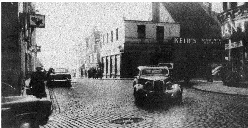
This photo shows part of Kirkgate in 1955. You used to be able to get anything in the Kirkgate. It was a great place to meander along and have a blether.