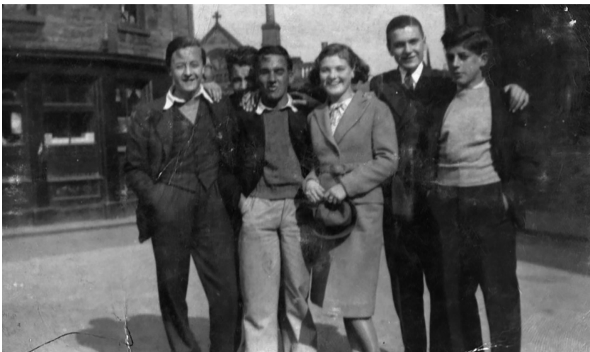
A group of Leith teenagers in the 1940s. The word 'teenager' only began to be widely used in the late forties. Up until 1947 children left school at 14 then went straight into work. The school leaving age was raised to 15 in 1947.

Leith Hospital in 1925. It was situated in Mill Lane. It closed in 1987.