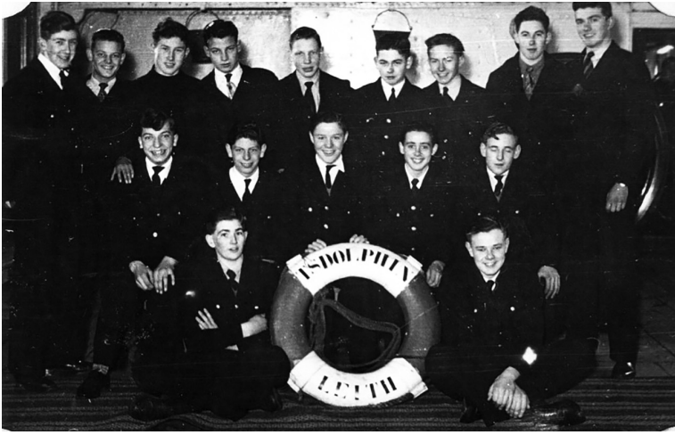
This photo shows students from the deck cadet course at Leith Nautical College on board the training ship TS Dolphin in 1954.

Whisky bottlers at William Muir Bond 9, Commercial Street, 1960. Leith was whisky and Edinburgh was beer. At one time the north side of Commercial Street was full of whisky bonds. It was mostly women who worked in the bonds.