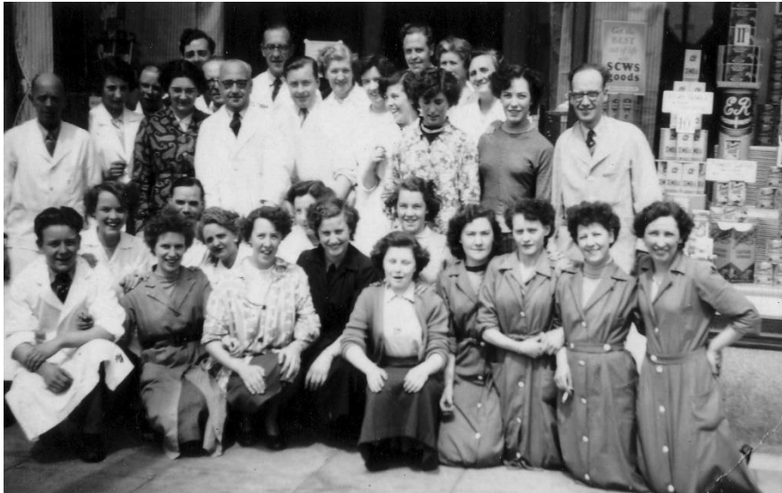
St Cuthbert's Association 'Store' staff outside the Piersfield Terrace branch in 1952.