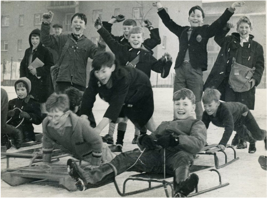
Boys from Oxgangs enjoying themselves on their sledges in the 1960s.