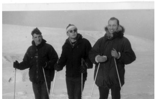
Skiers in the Pentland Hills in 1962.