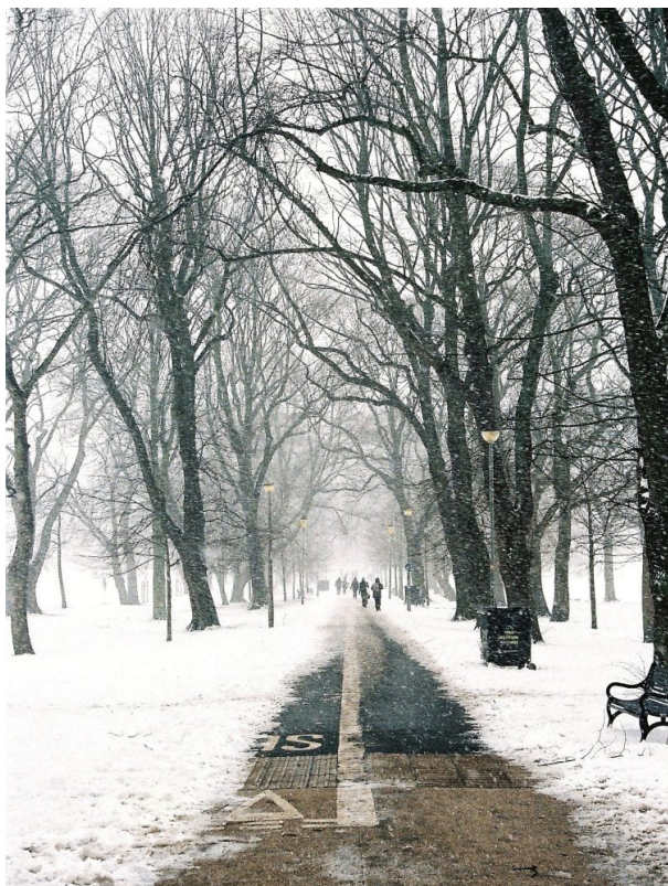
A wintry Meadows Walk.