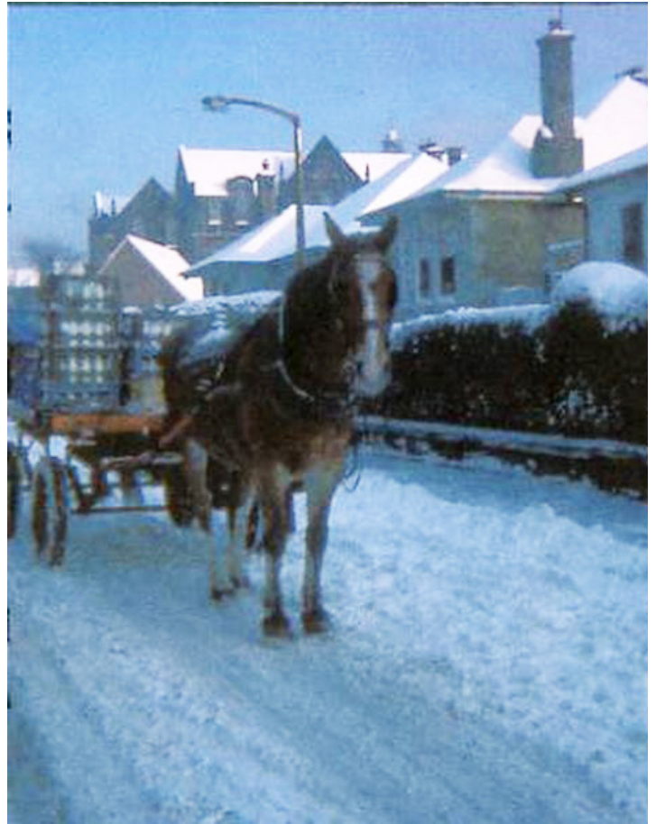
The Co-op milk horse, Cowan Road, 1975.