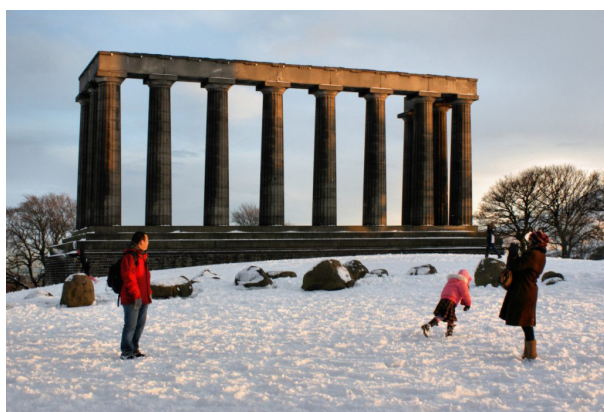
The monument on Calton Hill in 2010.