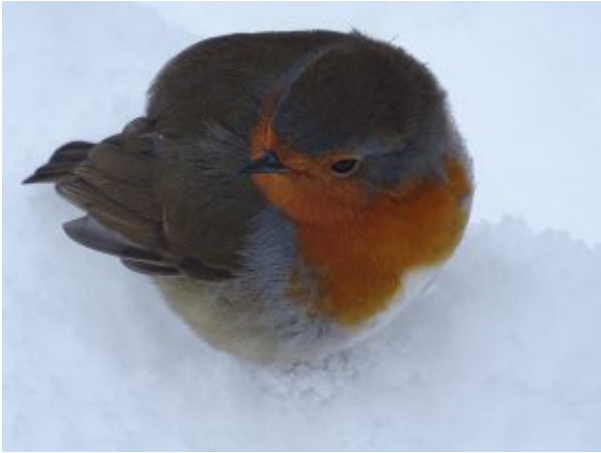
A robin redbreast in the snow.

Who killed Cock Robin? I, said the Sparrow, with my bow and arrow, I killed Cock Robin.