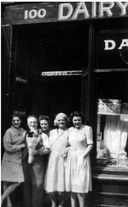
A dairy shop in Gorgie Road. A presentation of a bunch of flowers to a shopworker in 1945.