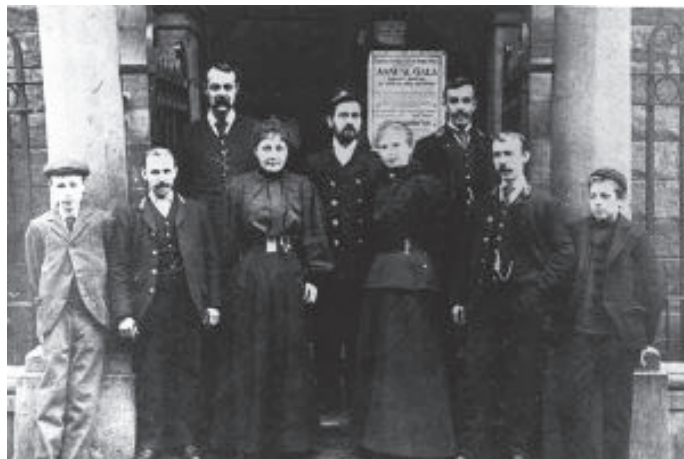
The staff at Dalry Baths in 1910.

The North British Distillery made large quantities of grain whisky for blending. This photograph looks down from the distillery into the cooperage yard. The site also had bonded warehouses, facilities for filling barrels, and a small cooperage.