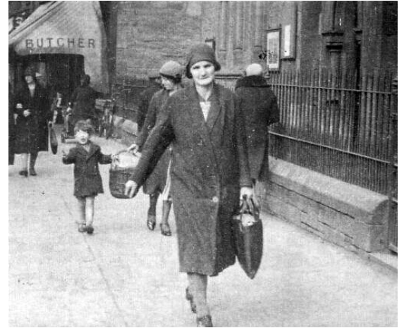
A woman carrying home the messages along Gorgie Road in 1930. This photo was taken by a street photographer.