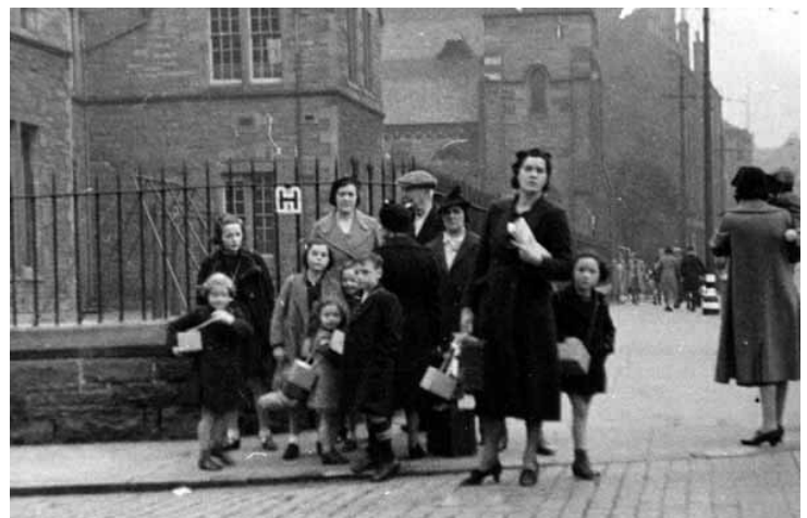
This picture was taken outside Dalry School on 1st September 1939. The children are all ready for evacuation because of the war. They are carrying gas masks in boxes.