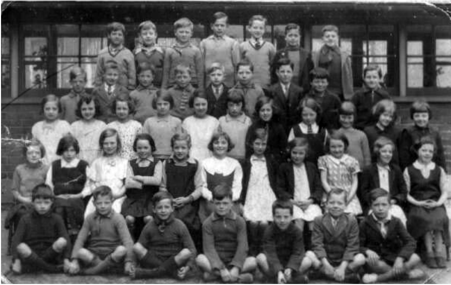
A class photo from Gorgie Primary School in 1931. The school would have been on the site of Aldi and McDonalds on Gorgie Road.