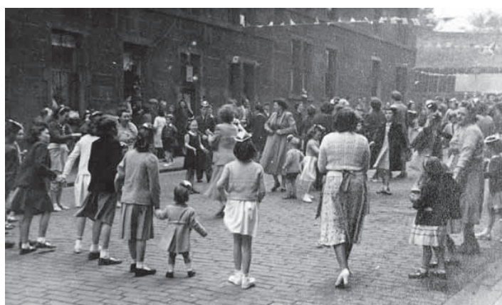
A Coronation Day street party in Newton Street on 2nd June 1953.