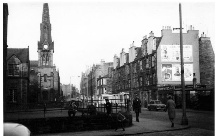
Dalry Primary School in the 1950s.