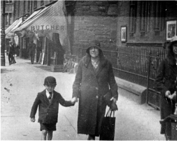
A photo taken by a street photographer. This woman and her son are walking past Cairns Memorial Church, which is now Gorgie Parish Church.