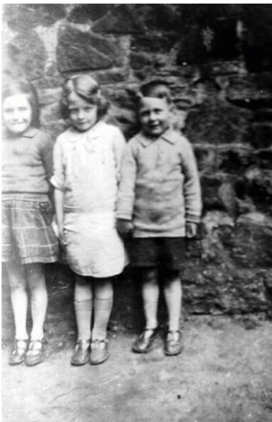
Three children leaning against the wall in the back green at 109 Gorgie Road in 1931.