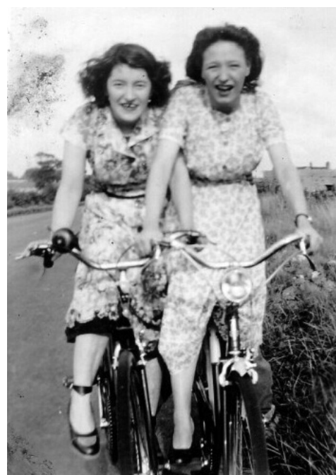
Two young women on their bikes in the 1940s.