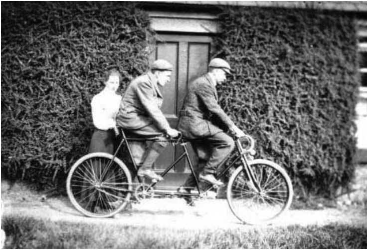
Two men on a tandem in 1905 in South Queensferry.