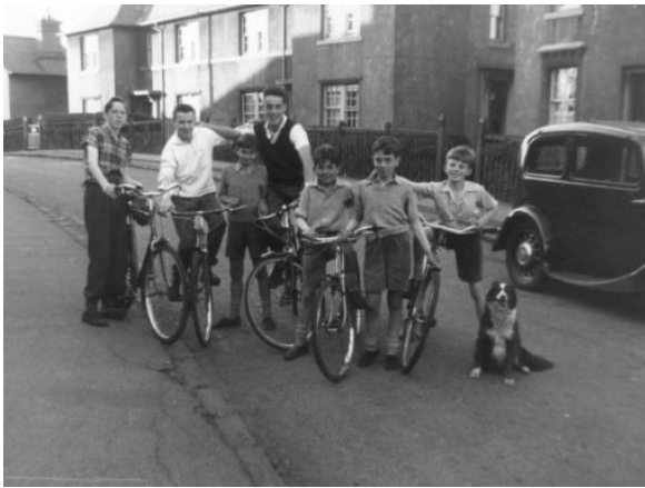
A group of boys on their bikes in Northfield Crescent in 1959.