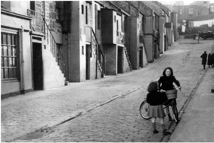
On the left we have a photo of two girls with one bike between them in New Lane, Newhaven in 1955.