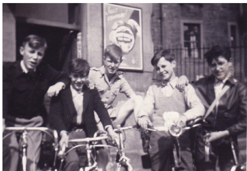
Boys on their bikes outside Waterstone's paper shop in Dumbiedykes in 1955.