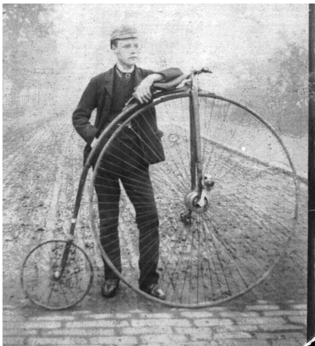
A Victorian Gentleman with a Penny Farthing in 1885. The man pictured worked as a foreman on the construction of the Forth Bridge which opened in 1890.