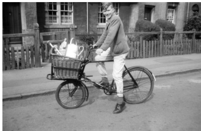
A delivery boy on a bike making deliveries for the ironmongers on Piershill Place.