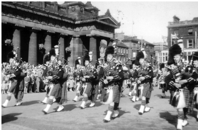
Pipe Band marching outside the Royal Scottish Academy, 1960s.