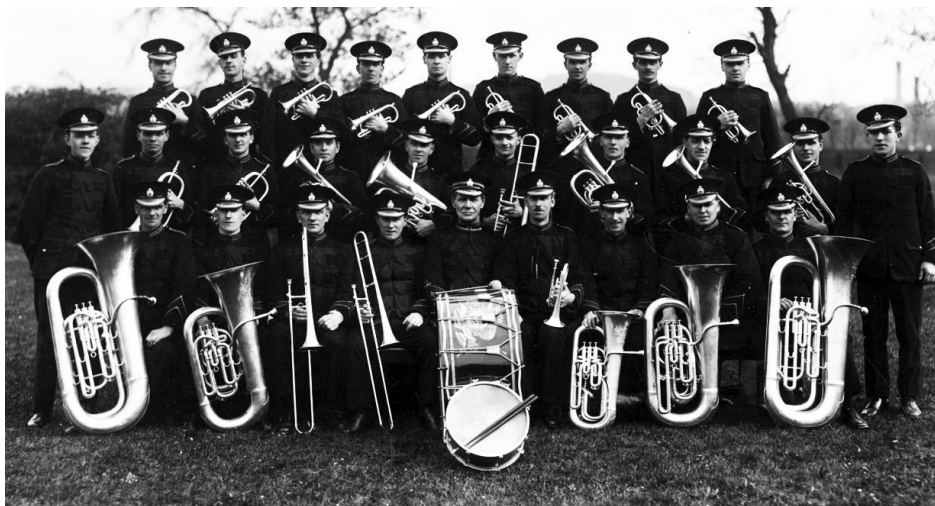
City of Edinburgh Band, 1920s.