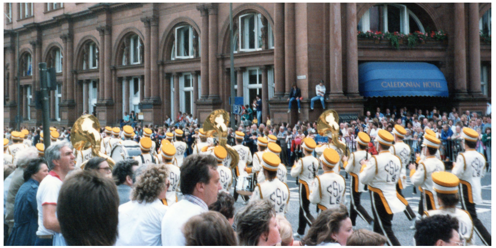
Jazz Band, walking up Lothian Road, part of the Jazz Festival Parade in July 1987.