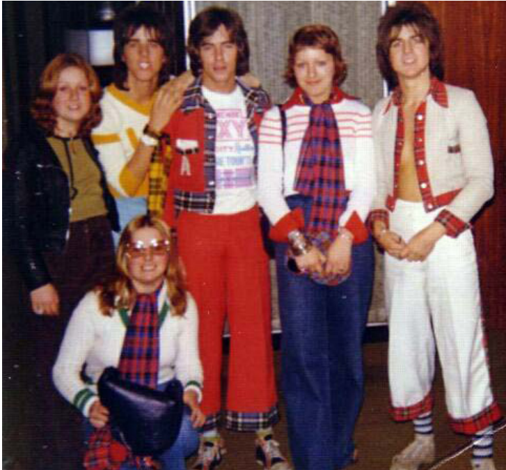
Fans with three of the Bay City Rollers in 1974. (L-R) Stuart 'Woody' Wood, Alan Longmuir and Eric Falconer.