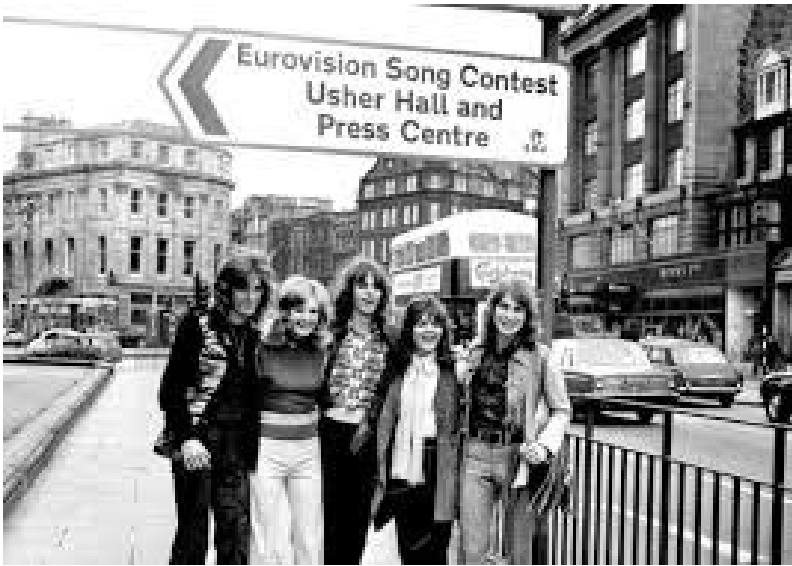
The New Seekers at the west end of Princes Street. The Eurovision Song Contest was held at the Usher Hall in 1972. They finished second with their song, Beg, Steal or Borrow . It was won by Vicky Leandros, representing Luxembourg, with Apres Toi .