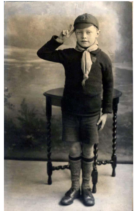
A studio portrait of a boy scout in 1931. He's wearing a pair of sturdy-looking shoes.