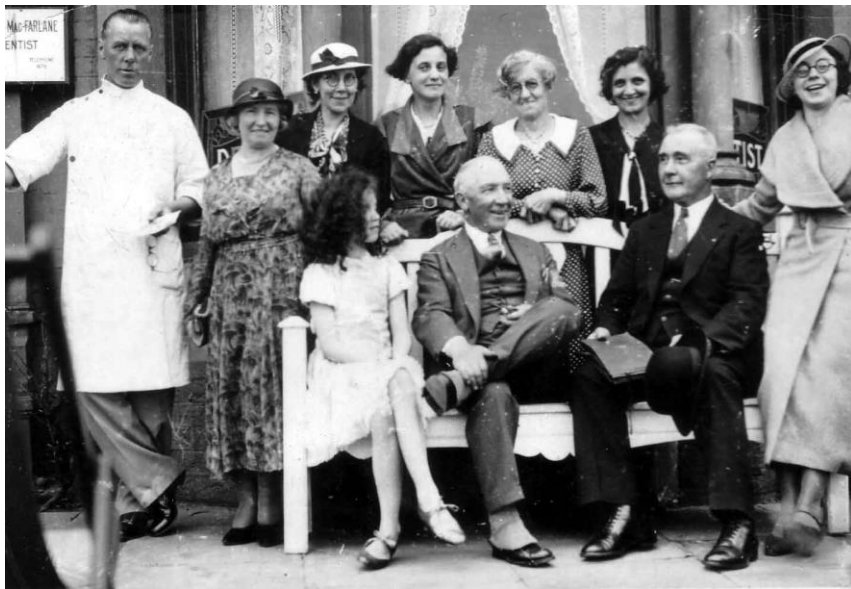
Blackpool promenade, 1934. Centre front, wearing spats, is Sir Harry Lauder.