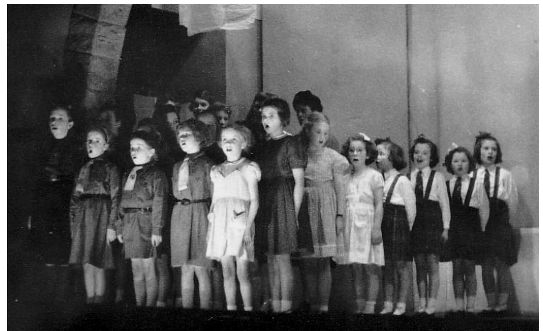
A Brownies Concert at St Anne's Church 1957.