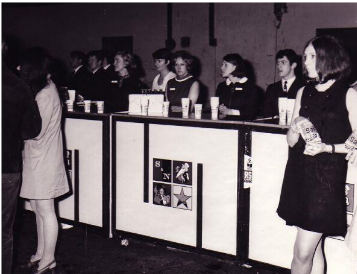
Makeshift bar at Waverley Market, late 1960s.