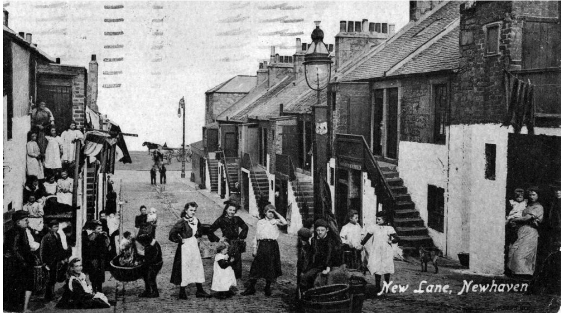
A Newhaven picture postcard from 1900.

The photo on the right shows a Newhaven Fishwife's family, Main Street, 1931. Newhaven Fishwives wear distinct clothing which clearly identified them. It consists of multiple layers of shirts, skirts, petticoats and aprons.