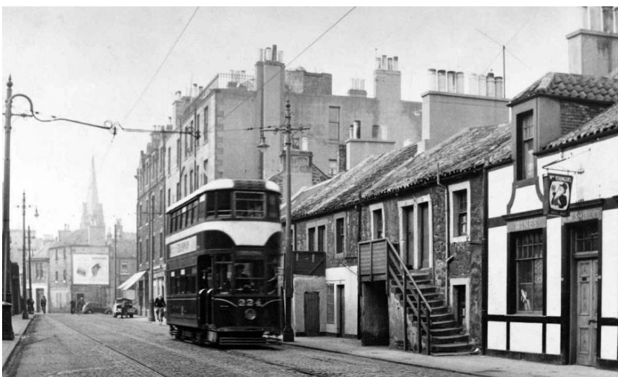
An electric Tramcar travels along Main Street in Newhaven in 1956.