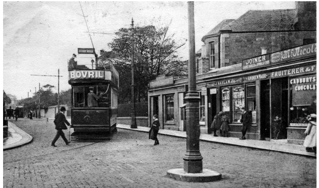
A picture postcard of the corner of Stanley Road and Newhaven Road in 1909.