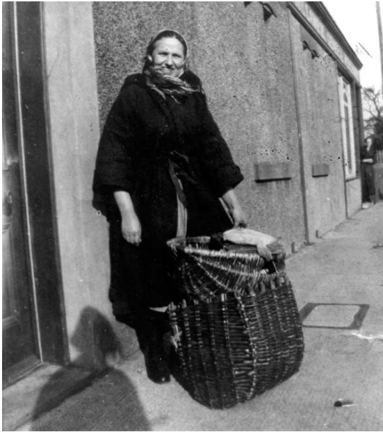
A Newhaven Fishwife in 1935.