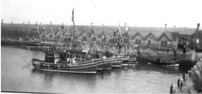
Trawlers lined up at Newhaven harbour in 1937.

The largest ship to be built in Newhaven was the Great Michael in 1511 for James IV. The ship was known world wide due to its size and guns. It was the largest vessel on the sea.