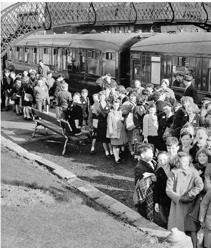
Murrayburn Primary School's St Andrews Day trip on the 21st March 1961. They are waiting to board the train at Gorgie East Station.