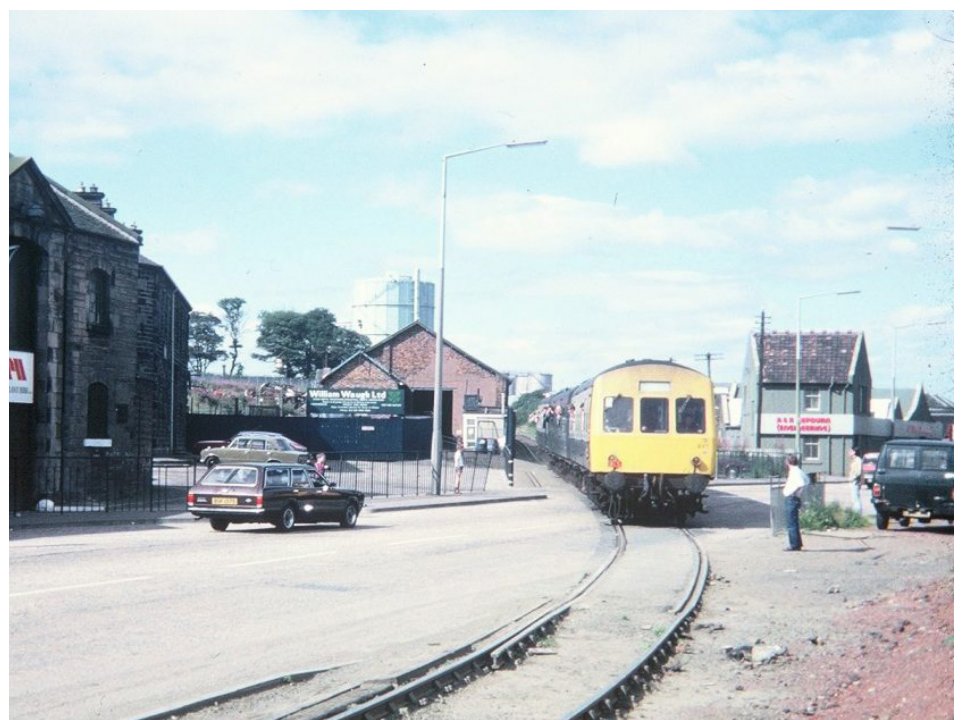
The last Passenger Train Between Waverley Sta- tion and Granton Square c.1980

Edinburgh was once served by dozens of railway stations, for example, Leith, Newington, Abbeyhill, Gorgie and Dalry, Corstorphine, Portobello and Granton. Now, only Waverley and Haymarket are still operating.