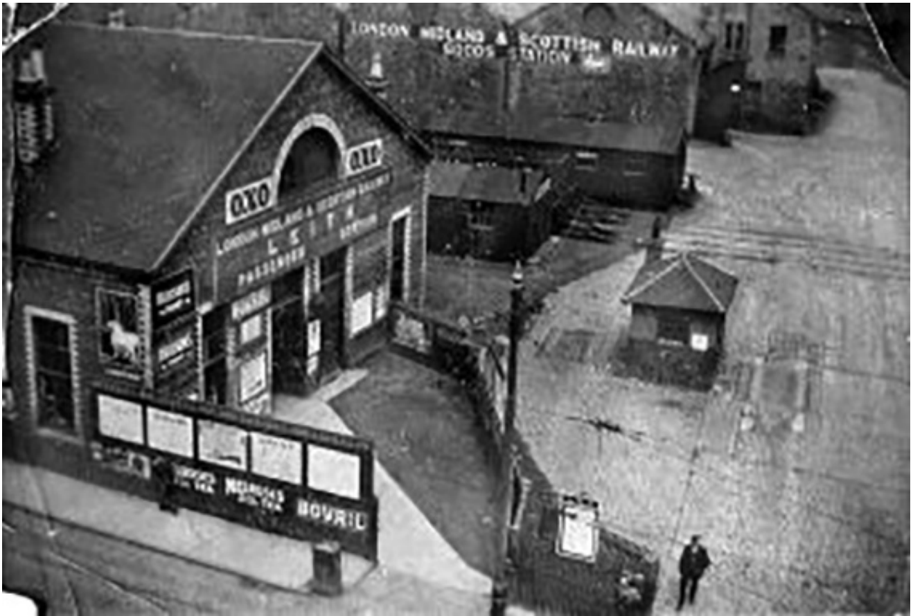
Caley station 1945