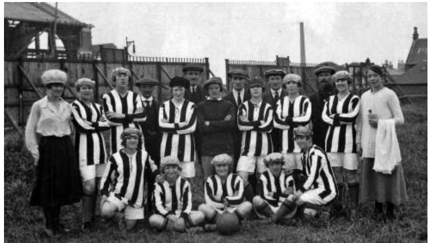
Portobello Thistle Ladies Football Team at Woods Park, 1918.