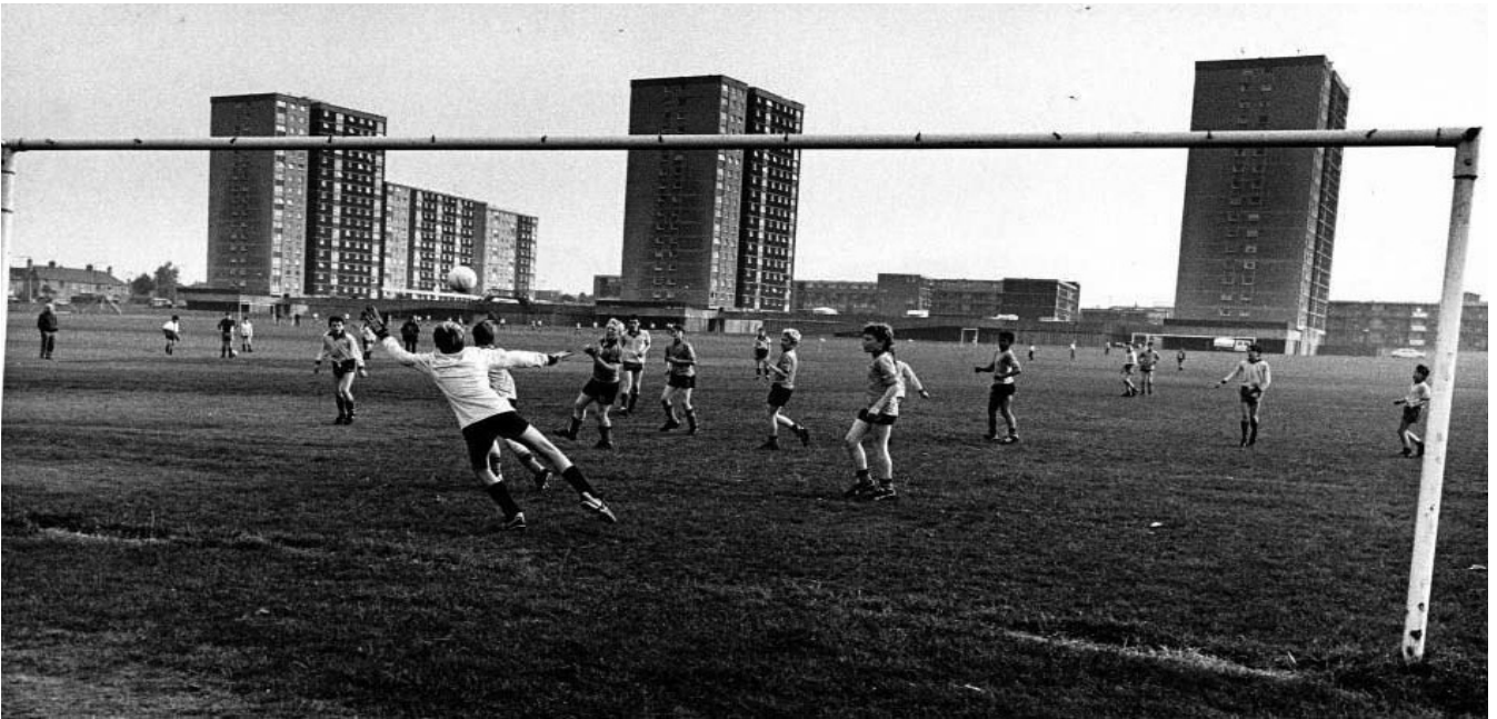
This photo is taken at Sighthill playing fields. Wester Hailes teams probably used it sometimes, and there would have been matches between different south west teams. 1980s.