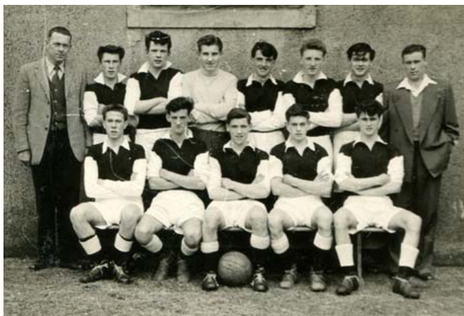
Pilrig Star football club team in 1955.