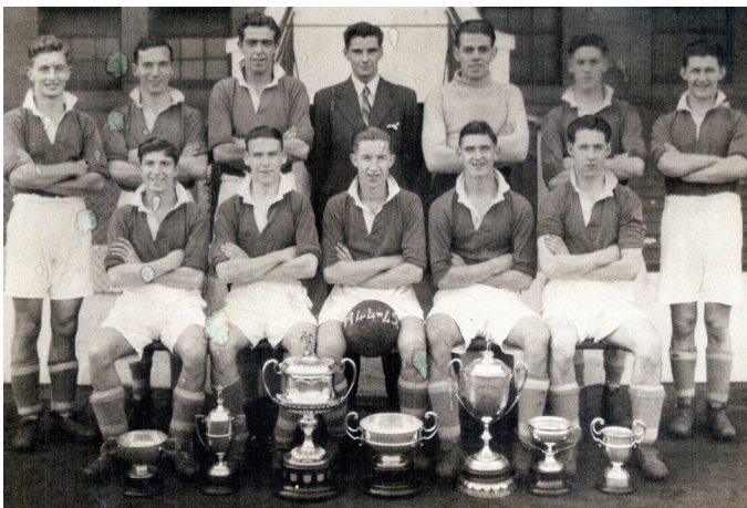
Edinburgh Thistle football club in 1945.