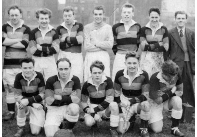
Henry Robbs Football Team in 1958.

A Meadowbank Thistle Football Cup programme for a match; Meadowbank Thistle versus East Fife in the B & Q Cup. This programme is from the collections for Edinburgh Museums and Galleries. 1992.