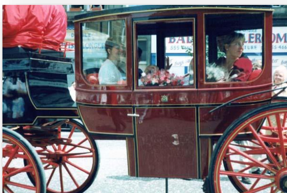
The Pageant Queen in her carriage.

‘Leith Festival is one of the oldest festivals in Edinburgh. Having started in 1907 with a pageant and Gala day (badge day) to raise funds for Leith Hospital (this was before the NHS), over a century later it’s still going strong. The structure of the festival remains the same, on the second Saturday of June a colourful Pageant proceeds down Leith Walk to the Gala day on Leith Links.’ Says Leith Festival Association (courtesy of www.leithfestival.com )