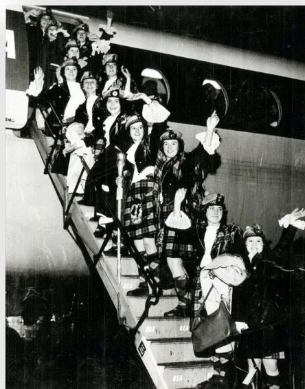
The Jean Carnie Pipe Band and dancers off to France.