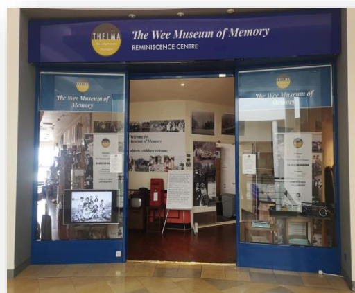
The Wee Museum of Memory at Ocean Terminal