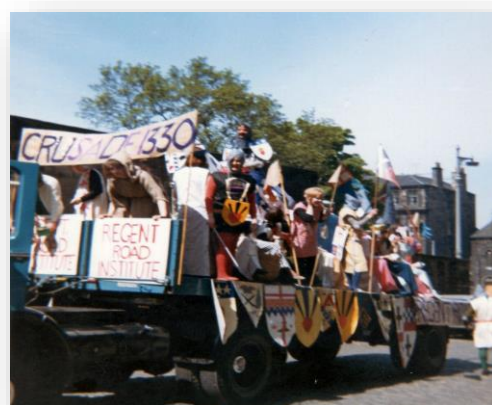
A Float in the Pageant

Wee Museum of Memory, Ocean Terminal, (next to Britannia), Leith EH6 6JJ. Open 10-3 Mon- Fri and 11- 3 Sat and Sun.